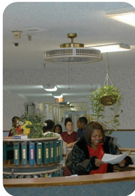
Purifans mount on the ceiling out of the way.