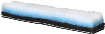
PurusAire I - Allergy and Odor Filter - For Allergy, Asthma and removing airborne allergens. Filter life depends facility situation.

Advanced Filters tuck snugly inside the Purifan and are easily replaced.