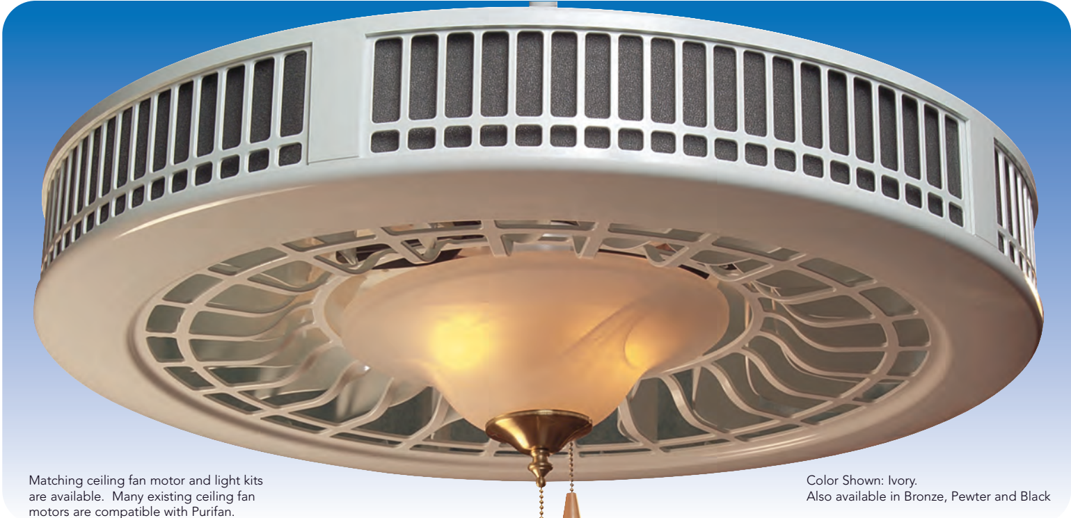
Matching ceiling fan motor and light kits are available. Many existing ceiling fan motors are compatible with Purifan.