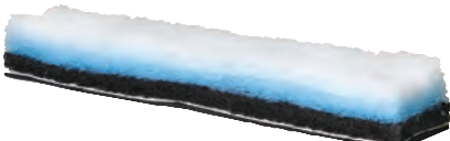
PurusAire I - Allergy and Odor Filter - For Allergy, Asthma and removing airborne allergens. Filter life depends facility situation.

Advanced Filters tuck snugly inside the Purifan and are easily replaced.