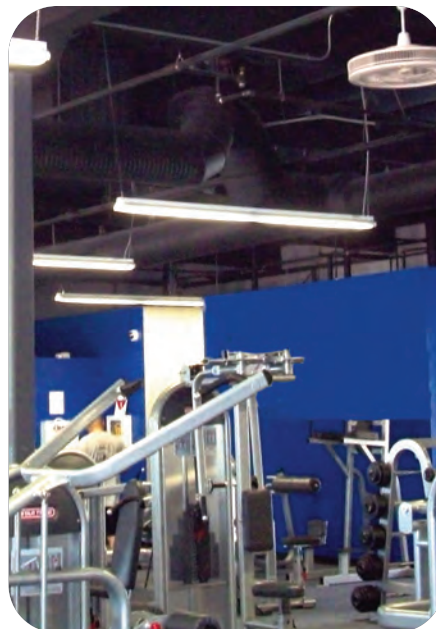
Purifan air is healthier and smells better