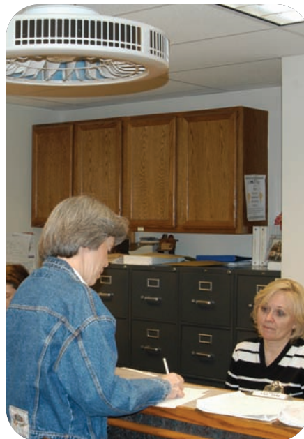
Reduce risk of catching illnesses from visitors