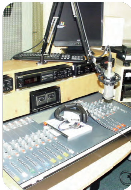
Reduces The Dust on Expensive Equipment