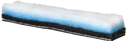
PurusAire I - Allergy and Odor Filter - For Allergy, Asthma and removing airborne allergens. Filter life depends facility situation.

Advanced Filters tuck snugly inside the Purifan and are easily replaced.