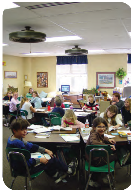
Cleaner air reduces illness and sick days