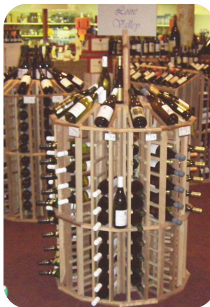
Dusting Displays Wastes Time and Money

The Purifan Clean Air System is easy to install in any building, even in rented buildings, and can be easily moved to new locations. Purifans mount to the ceiling, make no noise, produce ceiling fan airflow while filtering the air in a 20 x 20 x 8 foot area every 90 seconds. Purifans capture 90-95% of the typical dust that settles on surfaces and merchandise which means less wasted work for busy employees. Low-cost, energy-efficient Purifans are professionally installed, cleaned and serviced by Local Authorized Purifan Dealers.