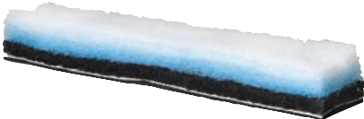
PurusAire I - Allergy and Odor Filter - For Allergy, Asthma and removing airborne allergens. Filter life depends facility situation.

Advanced Filters tuck snugly inside the Purifan and are easily replaced.